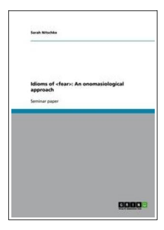
Filesize: 9.17 MB