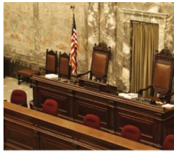
CRS Report for Congress: Environmental Protection Issues in the 107th Congress: August 14, 2002 - IB10067