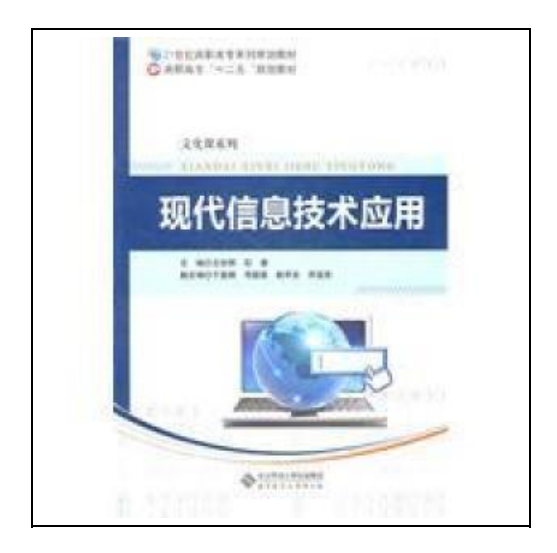
Filesize: 1.84 MB