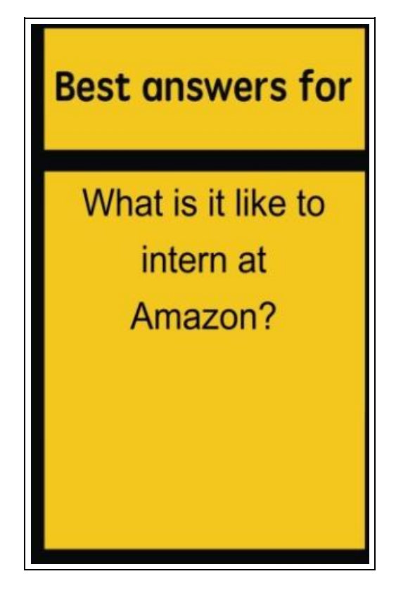
Filesize: 9.19 MB