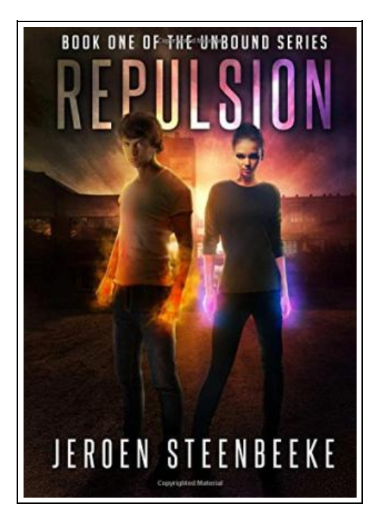
Filesize: 4.87 MB