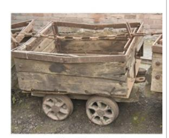
The Flotation Process