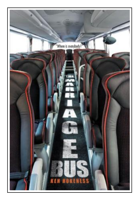
Filesize: 1.13 MB