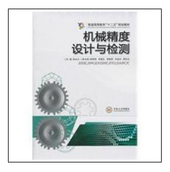
Filesize: 5.33 MB