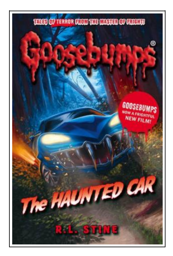
Filesize: 5.75 MB