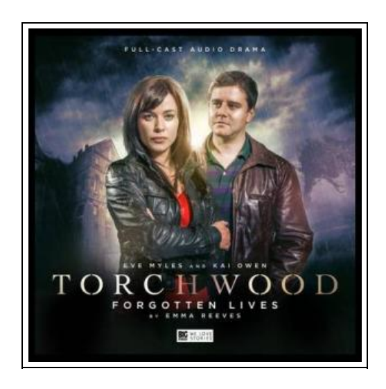
Filesize: 6.12 MB