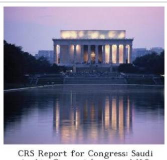
CRS Report for Congress: Saudi Arabia: Current Issues and U.S. Relations: August 1, 2005 - IB93113

Congressional Research Service: The Library of Congress, Alfred B. Prados