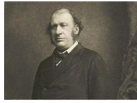
THE LIFE OF SIR JAMES FITZJAMES STEPHEN, BART., K. C. S. I., JUDGE OF THE HIGH COURT OF JUSTICE. BY LESLIE STEPHEN LESLIE STEPHEN