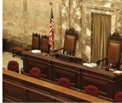
Evaluation of the State of Colorado's Care and Treatment Th Mentally Ill, Title 27, Article 10: A Report From the Colorado Department of Human Services, Division of Behavioral Health